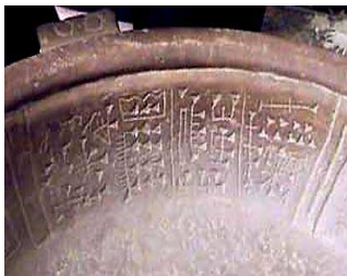
Fuente Magna Bowl