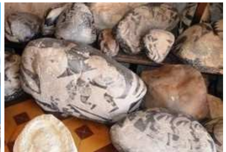
"The Ica Stones" - Museo Cabrera