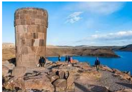
Chullpas of Sillustani